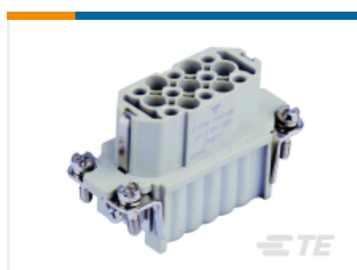
TE Part # T2020152201-000 HD-015-F