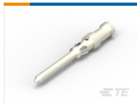
TE Part # T2020001025-000 CDM-2.5