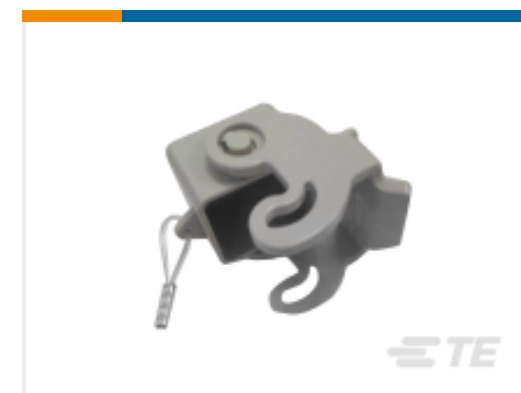
TE Part # T1010031100-000 H3A-KDTP