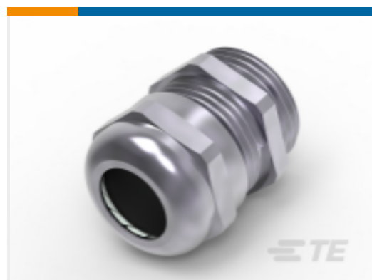
TE Part # T3609200102-000 DLX-20-M