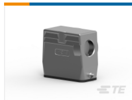
TE Part # T1319100125-000 H10A-TS-M25