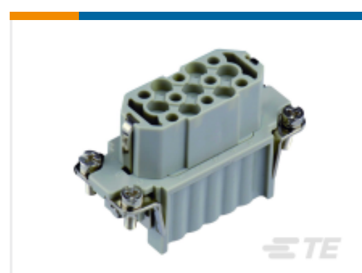
TE Part # T2020153201-000 HD-015-FJ